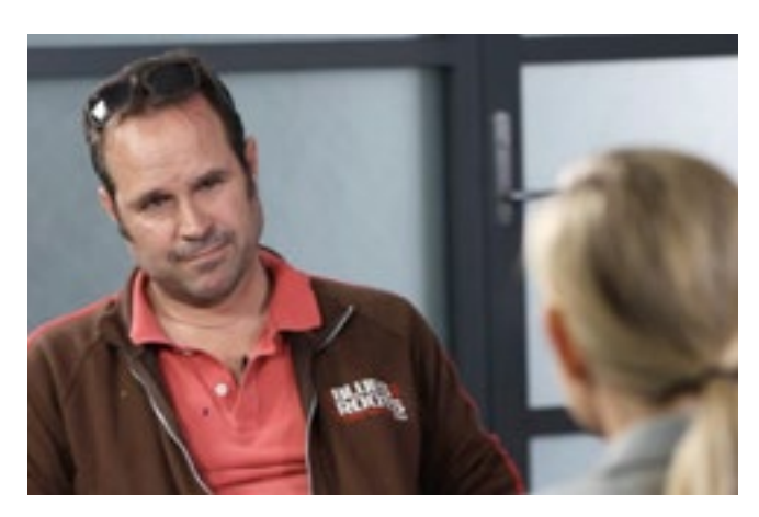
To view the video, visit racgp.cachefly.net/racgp/SuicidePrevention/Suicide-Risk-Assessment-1.m4v

This video was developed by the Black Dog Institute as part of their Advanced Training in Suicide Prevention, which is accredited with the GPMHSC as Mental Health Continuing Professional Development (MH CPD). Access more information about this training here www.racgp.org.au/education/courses/activity/icl=37053&q=keywords%3dsuicide%26specificRequirement%3dMH_CPD)